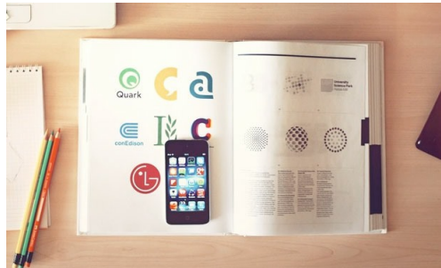
Logos Gallery >