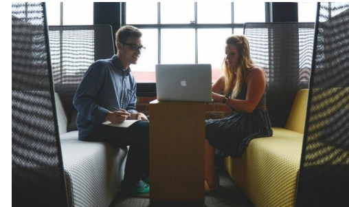
2018 Event Gallery >